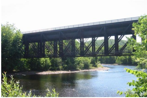
Railroad Trestle, Gorham NH