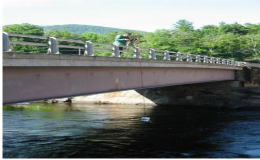
Meadow Rd., Shelburne NH