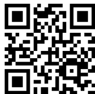
River Trail Guide